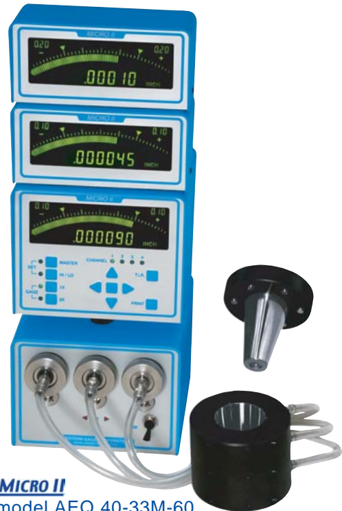
MICRO II model AEQ 40-33M-60 with #40 machine tool

Rapid inspection of parts is facilitated by displaying "out-of-tolerance" conditions in red. Using a highly visible bargraph display, the MICRO II shows the position of each feature relative to its product specification.