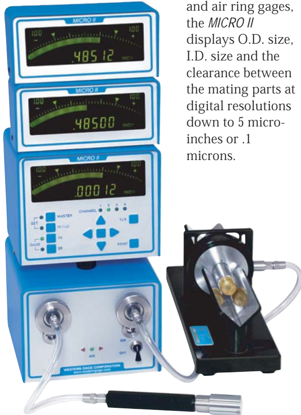
MICRO II model AEQ 40-32M-60

the MICRO II displays O.D. size, I.D. size and the clearance between the mating parts at digital resolutions down to 5 micro-inches or .1 microns.