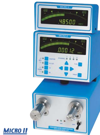
MICRO II model AEQ 40-22-10

Configured with three input channels and connected to a Western Gage custom air taper gage, the MICRO II is unsurpassed for fast and reliable inspection of internal and external tapers. The display shows front, middle and back deviations from true taper in products such as machine tools, medical prostheses, flywheel and pulley parts.