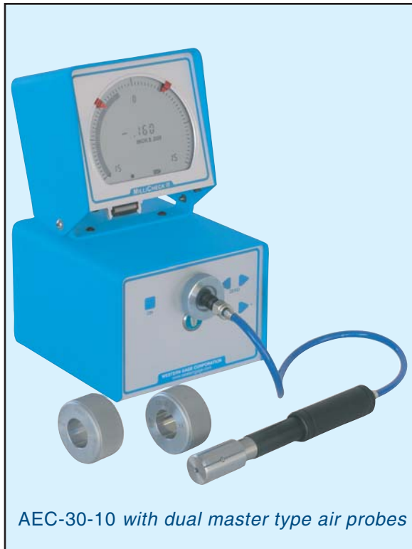
AEC-30-10 with dual master type air probes

MilliCheck Comparator Instruments replace dial type pneumatic comparator instruments. These next generation instruments feature high resolution, circular LCD bargraphs, along with four decade digital displays. They include user selectable scale ranges in English or Metric units, tolerance zone markers, and Hi / Lo air pressure annicators. -- specifications on the next page.