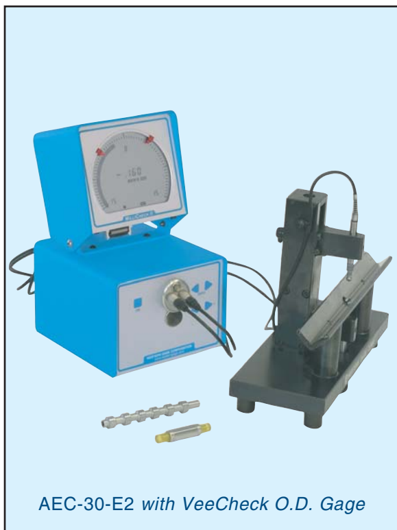
AEC-30-E2 with VeeCheck O.D. Gage

AEC - (XX) - (XX) Model No. - External Power / / Gaging Member Type - (30) - 110/125 VAC See below (31) - 220/250 VAC